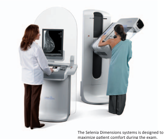
maximize patient comfort during the exam.